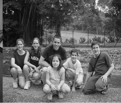
All of them at a park in Singapore